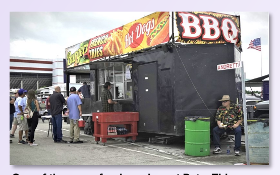
One of the many food vendors at Pate. This one was having a sale on hotdogs. Was $5.00, but now for a limited time only, $6.00 each.