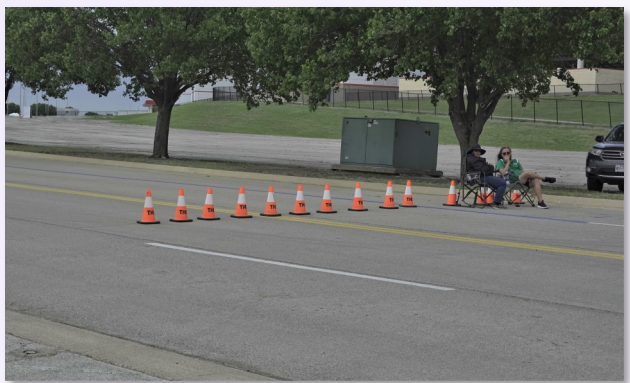
There are many tough jobs at Pate.