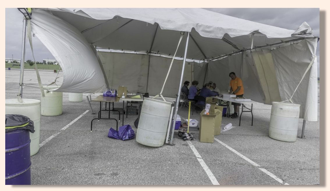
This the first hospitality tent set up for NTXCLC at Pate Swap Meet April 23rd. It failed to survive the weekend due to the Texas April winds.