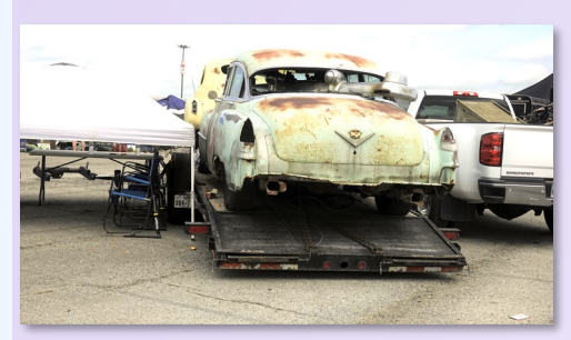
Another easy restoration here at Pate.