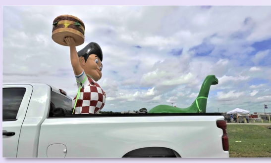
There is almost nothing you can't buy at Pate.