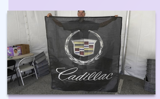
New Banner we bought at Pate, from a Model A vendor...